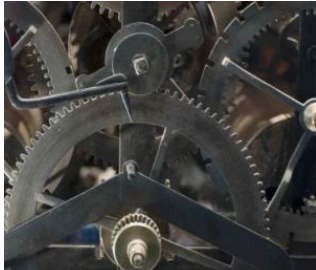
CUNNINGHAM COAL ENTRIES...